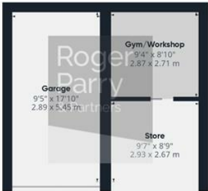
Ground floor Building 2